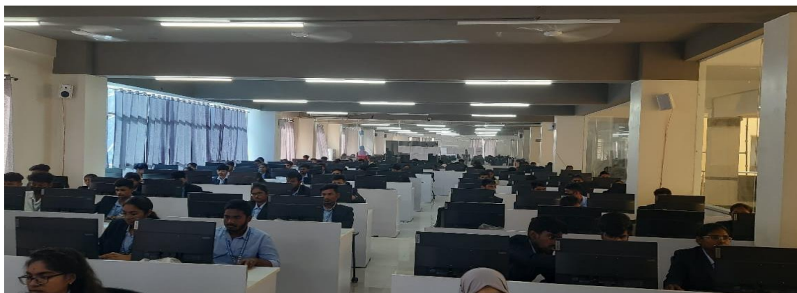
29-02-2024, 9:20AM-11:50 AM-(CSE: Room No.7112)