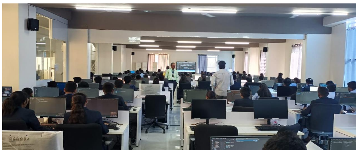
29-02-2024, 9:20AM-11:50 AM-(CSE&IT: Room No.7310)