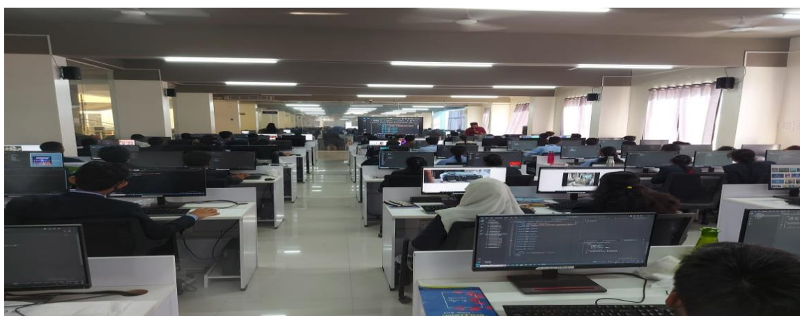
29-02-2024, 9:20AM-11:50 AM-(CSE & IT Room No.7113)