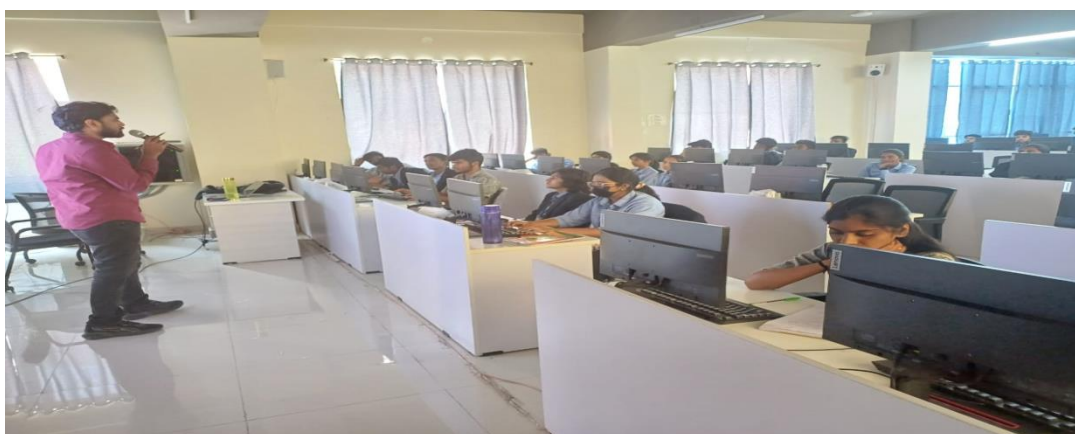
29-02-2024, 1:20PM-3:50PM ( IT- B& C: Room No.7112)