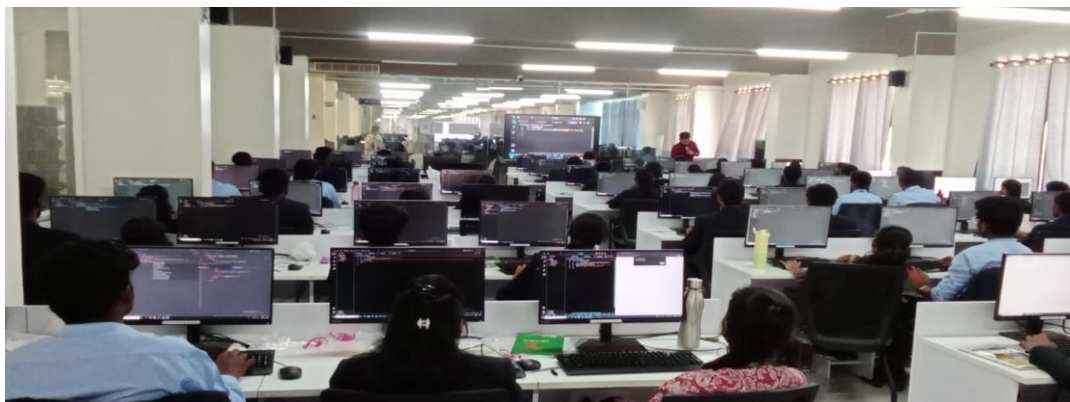
29-02-2024, 1:20PM-3:50PM (CSE(AI&ML)- A& B IT- C: Room No.7113)